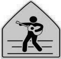
STREET BEAT FESTIVAL

Federal Hill Main Street's biggest and best festival, Street Beat, is just around the corner. Get a front-row seat for all the action by being a volunteer!