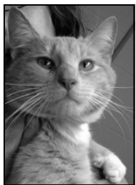
Pat, Buff Tabby

Need to be hugged and kneaded? Pat is your man! His very friendly fellow loves to put his paws around you and 'pat' you on the back. Pressing against you for real hugs and climbs on your shoulders too.