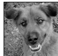
Nikko, Lab/German Shepherd Mix

Yep -- Nikko is that cute. Like a big teddy bear. Happy-go-lucky despite his crooked front leg. He gets around well, but has a funny gait like an old saddle sore cowboy, tossing his leg out to the side. He love treats and sits on cue. Soft and lovable.