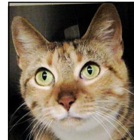
Sparkles Kennel 94

Sparkles is a gorgeous ginger and blue tabby/tortie (dilute torbie) who curious, yet calm in her kennel. Would love a house of her own to explore. Sweet girl who loves to greet you at the door. Already spayed so she can go home today!