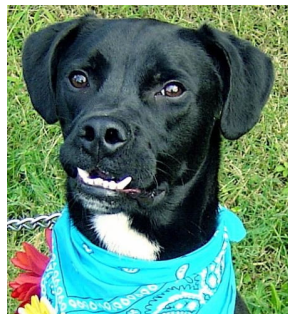
Mighty, kennel #11