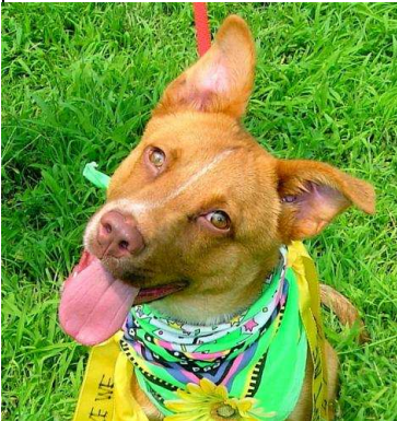
Dizzy kennel #1

Dizzy is quite a character! He knows sit on command and shoe off his inquisitive, coy side. Affectionate and fun.